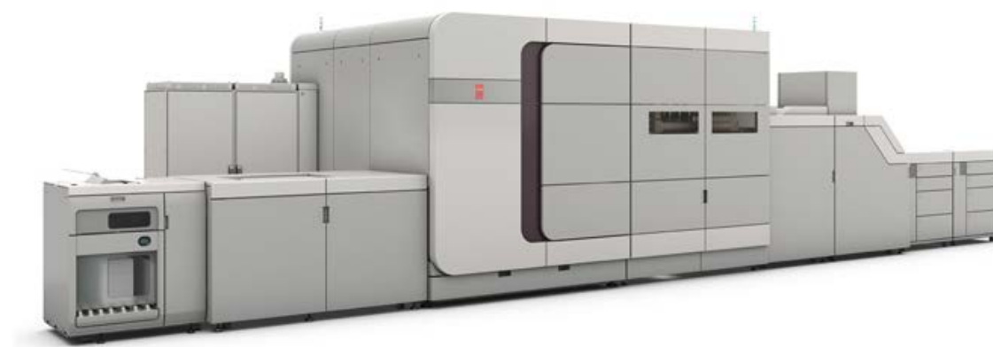
Figure 1 Océ VarioPrint i300 from Canon Solutions America

It's not often a product comes along that defies classification, but instantly finds a home among a wide range of constituencies. The Océ VarioPrint i300 from Canon Solutions America is such a product. It's a sheet-fed production color inkjet press, about twice as productive as similar class digital color toner presses. It is suited for book printing to transaction statement printing, including the availability of MICR inks for check printing. Among its most appealing features is a development path to allow the i300 to print on common offset substrates; the range of qualified papers is expanding daily.