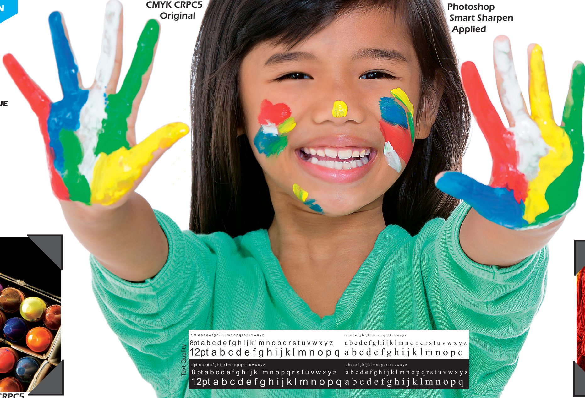
CMYK CRPC5 Photoshop Smart Sharpen Applied

6pt Blue Text Quality 9pt Blue Text Quality 10pt Blue Text Quality 14pt Blue Text Quality 14pt Blue Text Quality 10pt Blue Text Quality 9pt Blue Text Quality 6pt Blue Text Quality 6pt Red Text Quality 9pt Red Text Quality 10pt Red Text Quality 14pt Red Text Quality 14pt Red Text Quality 10pt Red Text Quality 9pt Red Text Quality 6pt Red Text Quality 6pt Green Text Quality 9pt Green Text Quality 10pt Green Text Quality 14pt Green Text Quality 14pt Green Text Quality 10pt Green Text Quality 9pt Green Text Quality 6pt Green Text Quality